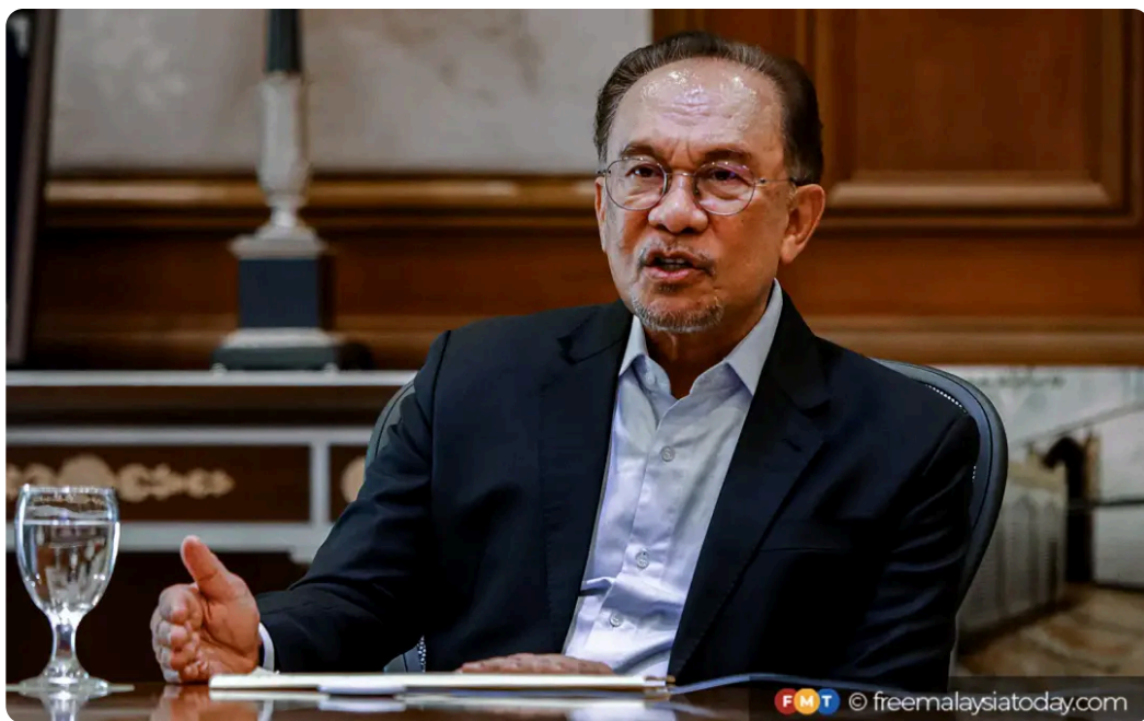
Prime Minister Anwar Ibrahim said the government has implemented several measures to raise public awareness about the unclaimed funds.

PETALING JAYA: A total of RM12.7 billion in unclaimed money is awaiting its rightful owners as of Jan 31, says Prime Minister Anwar Ibrahim.